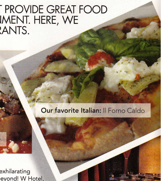
Our favorite Italian: Il Forno Caldo