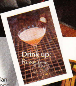
Drink up: Rosé