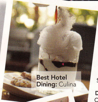
Best Hotel Dining: Culina