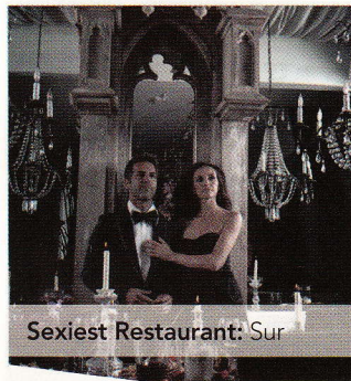
Sexiest Restaurant: Sur

GENLUX SETS OUT IN SEARCH OF ESTABLISHMENTS THAT PROVIDE GREAT FOOD AND GREAT SERVICE IN A GLAMOROUS ENVIRONMENT. HERE, WE PRESENT OUR LIST OF LA'S TOP RESTAURANTS.