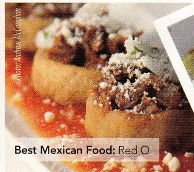
Best Mexican Food: Red O